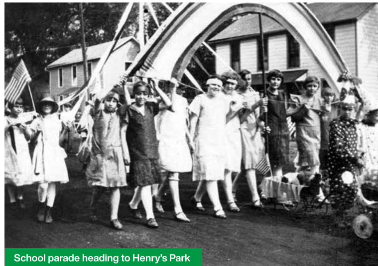
School parade heading to Henry's Park

This date will also be the occasion for a great welcoming home of the returning soldiers and sailors. A big parade will take place at 10 o'clock and prominent speakers have been obtained for the day. Fireworks and dancing in the evening at Imaginary Hall will be featured.